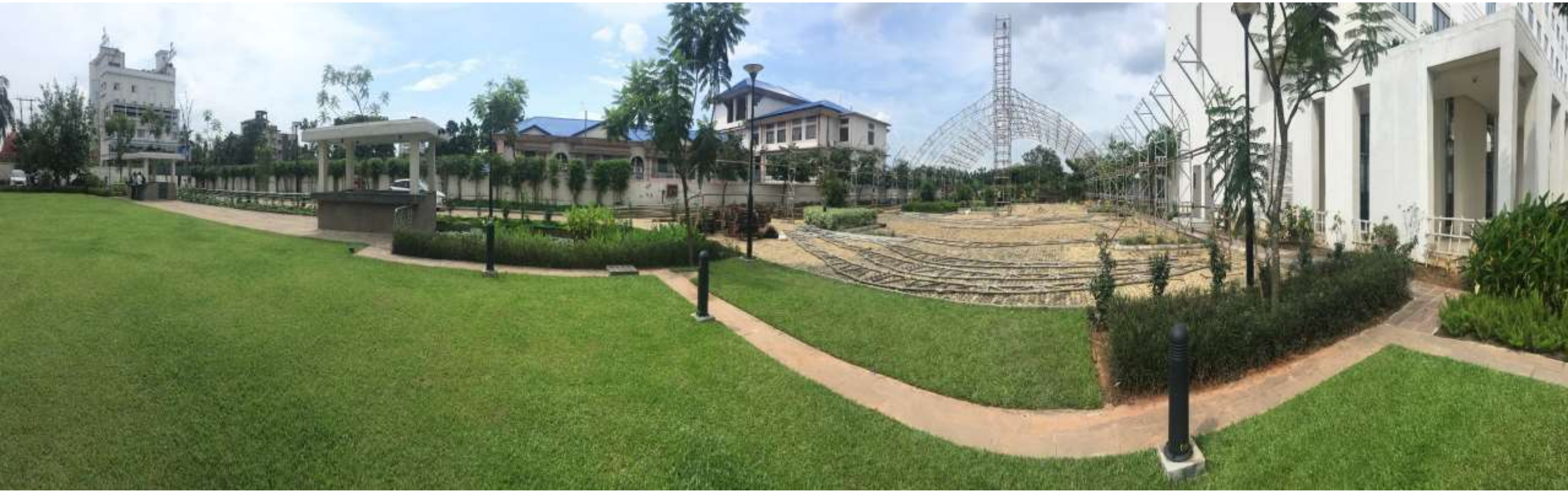
The Largest Open Space – Manas Lawns