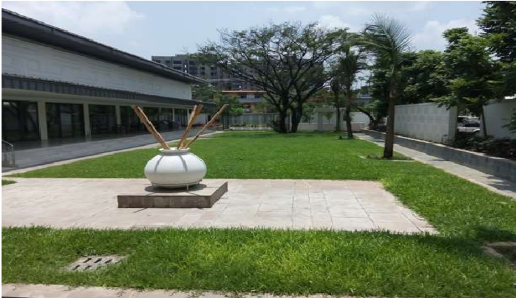
The Banquet Lawns – Attached to Joysagar Hall